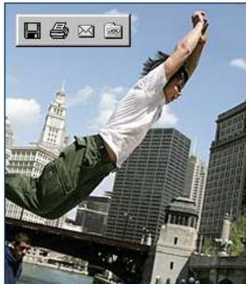
Practicing against the skyline.