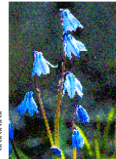
Some suburban settings, brought to life with recent moisture, catch the morning sun Tuesday.