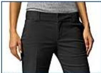
Hot summer pants