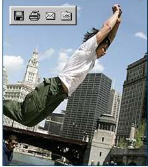
Practicing against the skyline.