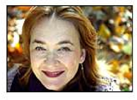
Q&A TRANSCRIPT What's Cooking?

Myth: If you take print heads, cut them in half and place emphasis on the first two words, you're headlines will pull readers in.